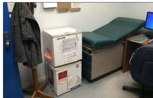
Figure 2: Exam table placement preventing patient from fully extending on the exam table