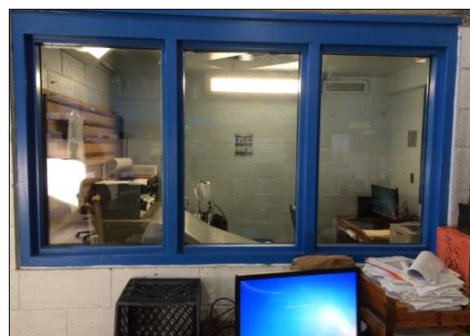
Figure 1: Lack of visual privacy, no privacy screen available