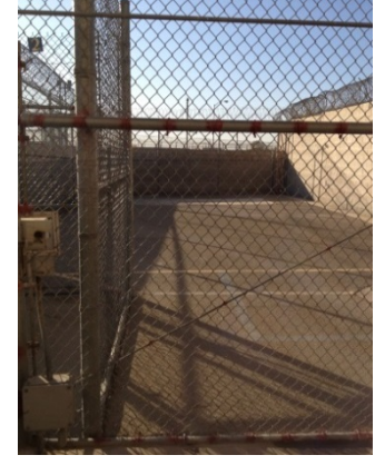
CCWF ASU Small Management Yard