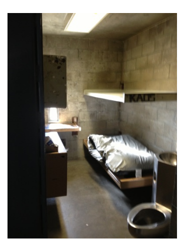
270-Degree Design Cell

CIW and CCWF both house their SHU inmates in buildings with the same design (two-tiered, 270-degree<sup>4</sup> design buildings). CIW's consists of 60 SHU beds (30 cells), 30 ASU beds (15 cells), and 10 ASU/EOP beds (5 cells). CCWF's consists of 90 ASU beds (45 cells), and 10 EOP beds (5 cells). The cells are identical. They are approximately 66 square feet and contain two metal beds (an upper bunk and a lower bunk), a metal desk and stool, shelving for property, and a metal one-piece toilet and sink combination unit. The SHU/ASU cells are well lit, with a solid metal door containing one narrow window in the door and one narrow window facing the outside on the opposite side of the cell.