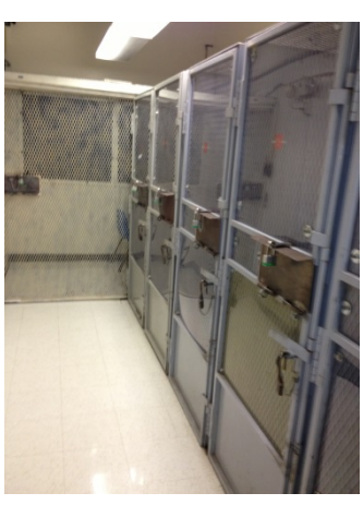
CIW Non-Contact Visiting Inmate Cells

Adminstrative Segregation Unit, SHU, and PSU Welfare Checks. The department has had a long standing policy related to 30-minute welfare checks for inmates in segregated housing, the purpose of which is to limit the opportunity an inmate has to commit acts of self-harm. The welfare checks are conducted by custody officers at staggered intervals, three times per hour, not to exceed 30 minutes, for at least the first 21 days of segregated housing. Clinical staff may request that the welfare checks extend beyond the first 21 days, when clinically indicated.