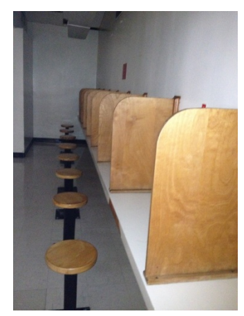
CIW Non-Contact Visiting Attorney and Visitor Area

Our review found that at CIW, because SHU inmates are not allowed contact visits, attorney visits were sometimes conducted in the regular non-contact visiting booths, which are not conducive to private or confidential conversations, due to the the close proximity of other inmates on one side of the glass and other visitors side-by-side with the attorney on the other side of the glass.